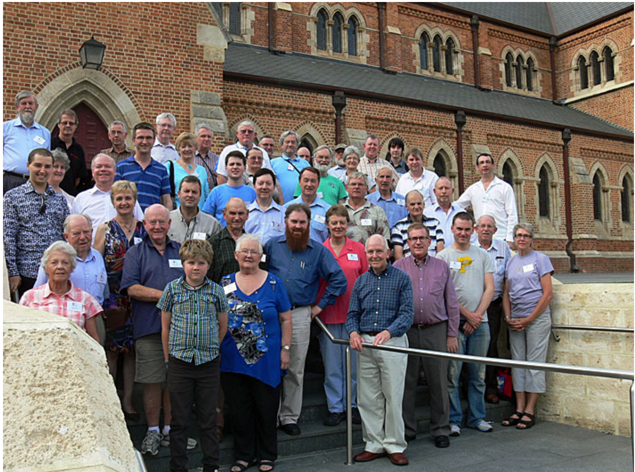
The 2012 WA Conference Participants standing outside St George's Cathedral. 12th April, 2012

Copies of the 2012 conference book, in A4 format and illustrated, with a total of 94 pages, are available from the Organ Historical Trust of Australia, PO Box 676, Sydney, NSW 2001. The cost per copy is $20.00, inclusive of postage throughout Australia; overseas rates upon application. Cheques for this amount should be made out to the Organ Historical Trust of Australia.