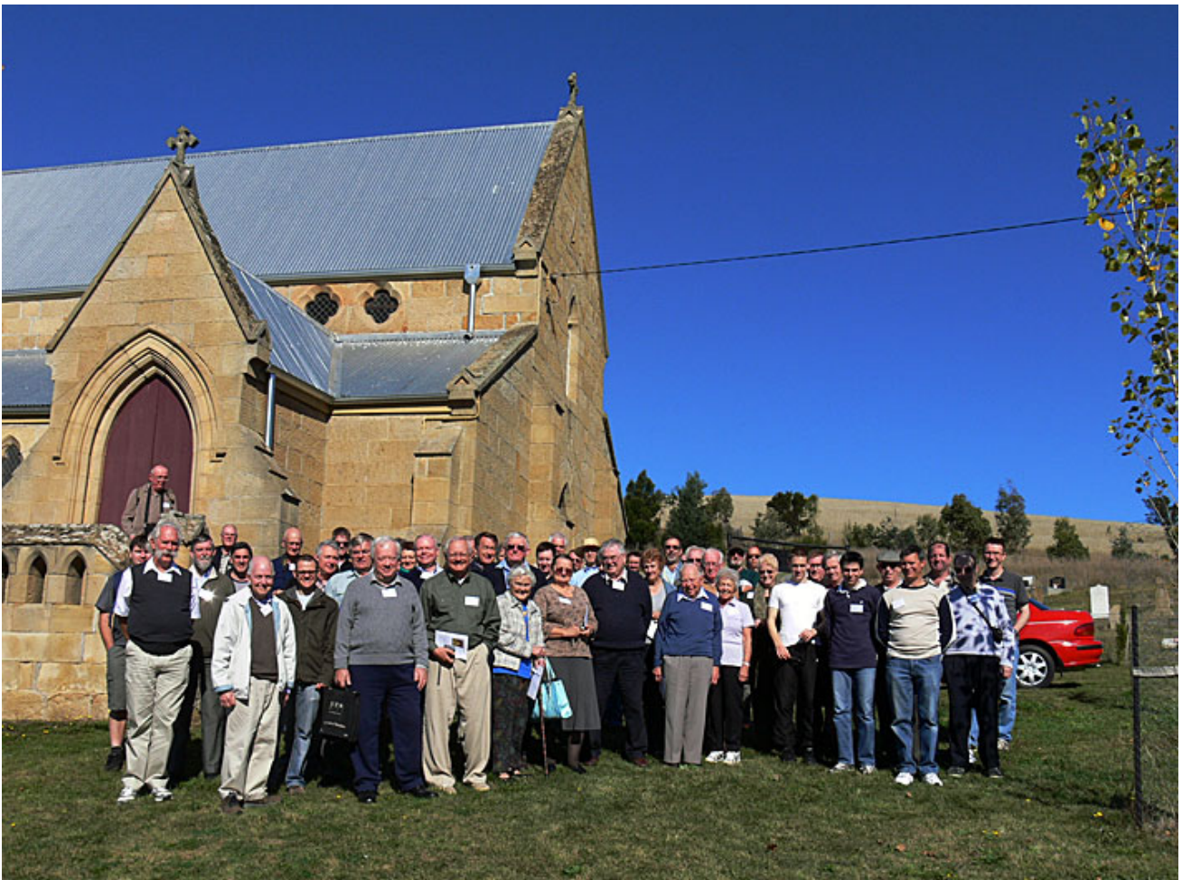
Conference participants at St Patrick's Catholic Church, Colebrook, Tasmania (Photo: Brian Andrews, 27 April 2011)

Please click here to purchase a copy of the Conference Book .