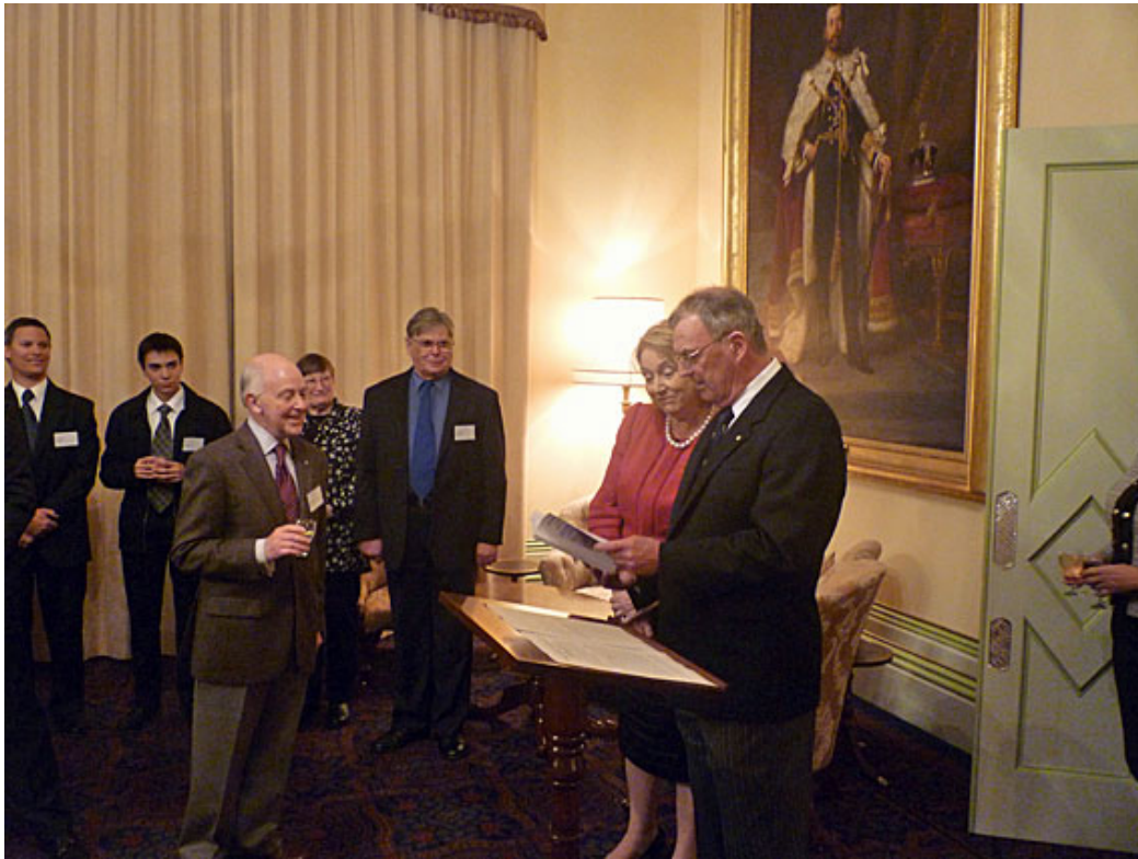
Government House Reception (27 April 2011)

Organs by the following builders were visited: