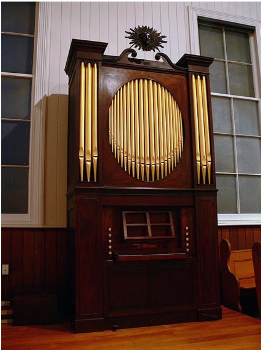
Restored 1779 John Avery organ at Ponsonby Baptist Church.

Download Conference Brochure by clicking here