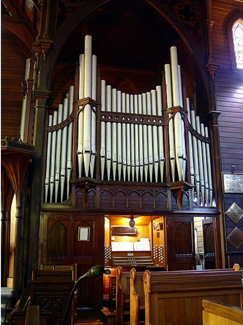
Holy Sepulchre Anglican Church, Auckland: three manual Brindley & Foster 1896 / Norman & Beard

see and hear a number of historic instruments, particularly those by the significant local firm of George Croft together with Lawton & Osborne , an offshoot of a prominent Scottish firm.