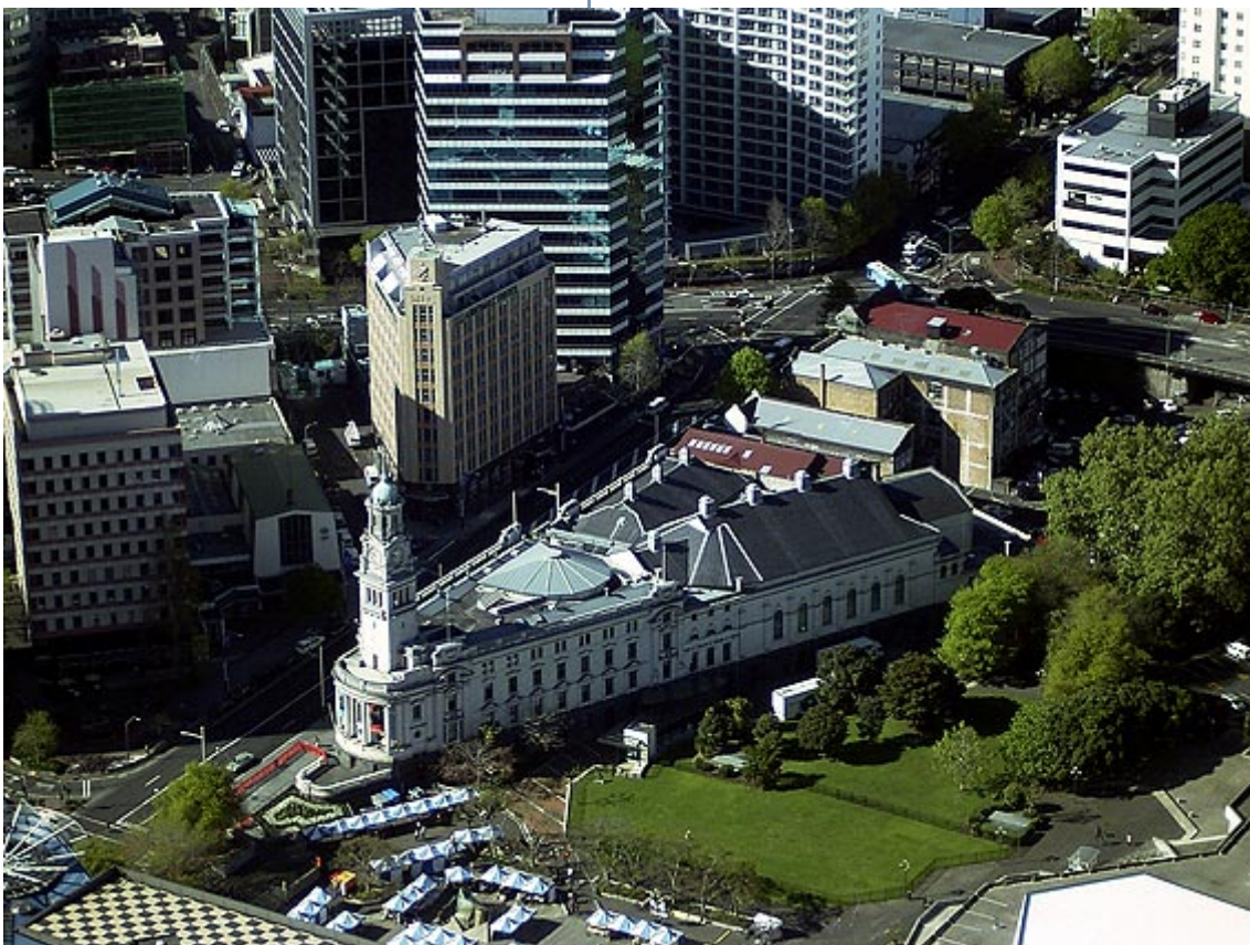
Auckland Town Hall with Conference Hotel (Airedale) behind [MQ]

The 2006 OHTA Conference to the North Island of New Zealand gave members the opportunity to