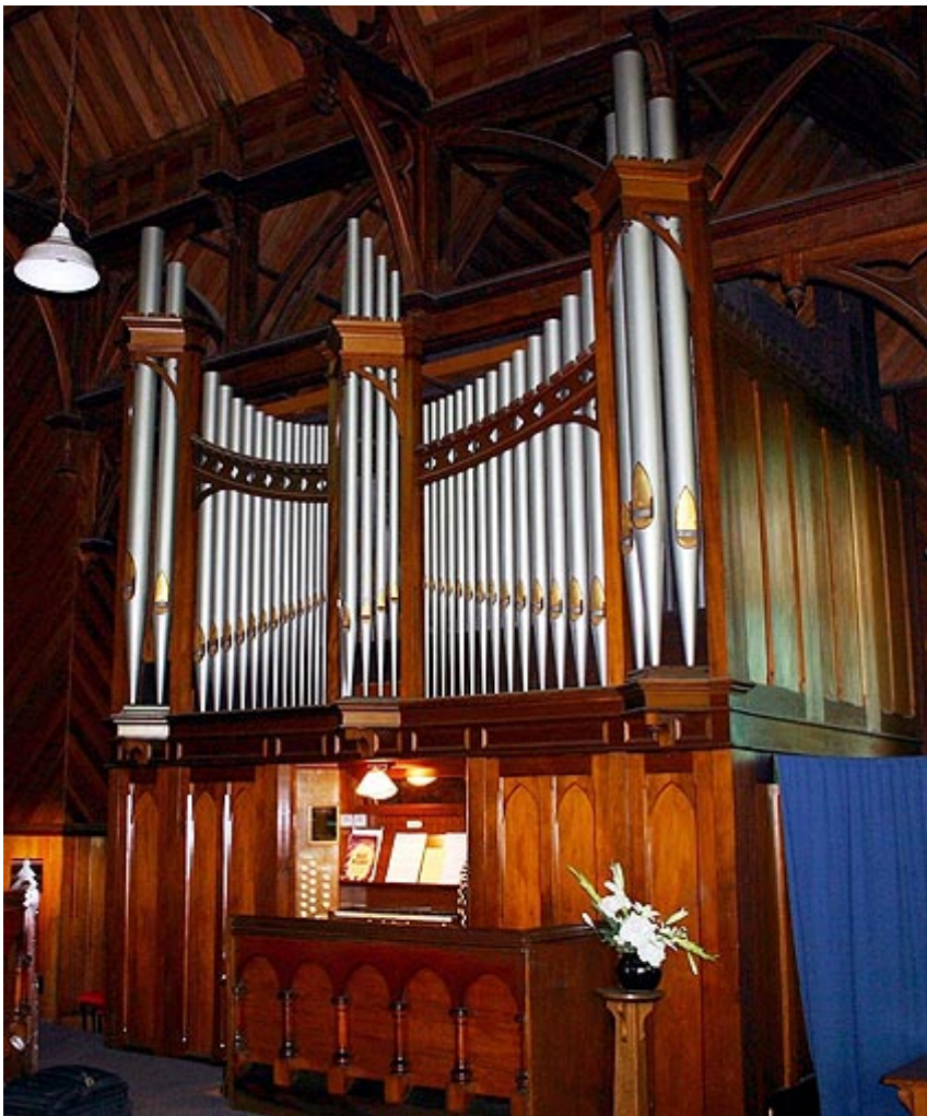
Knox Presbyterian Church, Parnell, Auckland - two manual Croft 1911