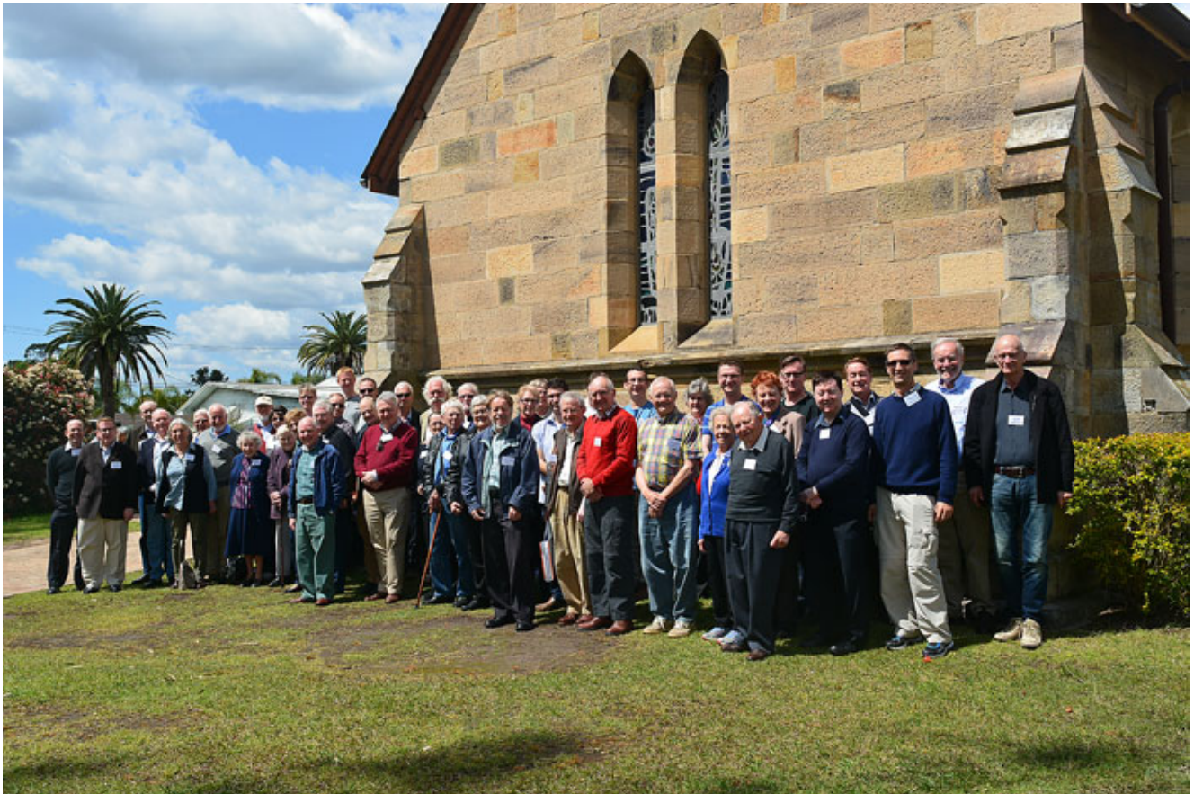
Group shot taken outside St John's Anglican Church, Raymond Terrace

Sunday 27 September - Saturday 3 October 2015