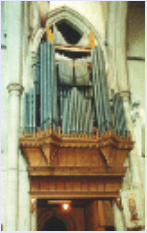
St Peter's Anglican Cathedral , North Adelaide Hill, Norman & Beard, London & Melbourne, 1929 4 manuals, 50 speaking stops, electro-pneumatic action