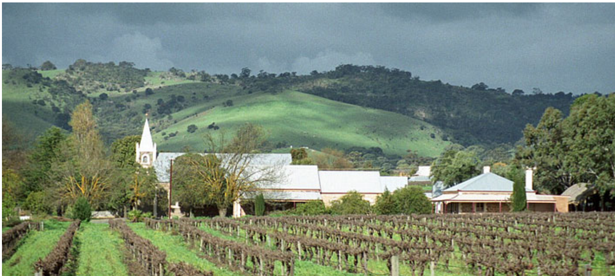
Bethany