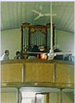
Holy Cross Lutheran Church , Gruenberg / Moculta B 1871 D.H. Lemke. 1 manual, 4 speaking stops, no pedals, tracker action.