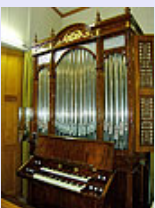
Holy Trinity Lutheran Church , Para Road, Nuriootpa B 1877 Gebrüder Walter Guhrau Pr, Schliesen (opus 118); inst c.1888 St Petri Lutheran Church, Nuriootpa; inst 1966 present loc; res 1988 Roger Jones. 2 manuals, 7 speaking stops, 3 couplers, tracker

Official reception and opening of Conference at The Barossa Council