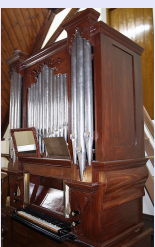
St John's Lutheran Church , Ebenezer Road, Ebenezer B 1875 D.H. Lemke. 1 manual, 4 speaking stops, no pedals, foot blown. Man: 8.8.4.2.

St Thomas' Lutheran Church , cnr Stockwell & Duck Ponds Rds, Stockwell