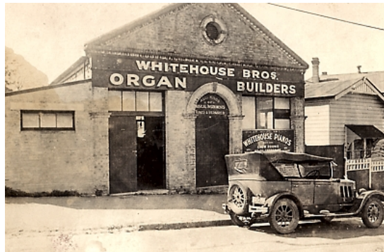
The Whitehouse Bros factory at Musgrave Road, Red Hill